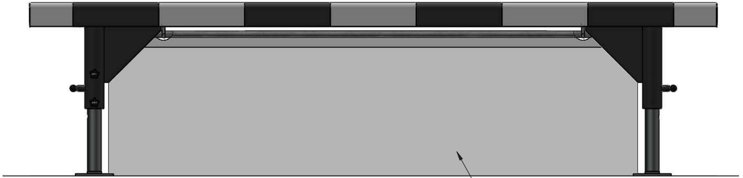
Approach Side View

The light weight barrier seal moves up and down with the barrier to prevent glare at all heights.